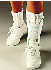
Air Stirrup brace - compresses and supports the ankle after an acute injury