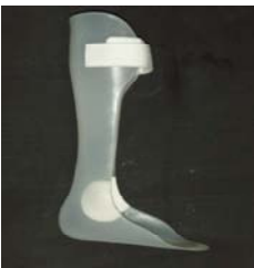
Solid Ankle Foot Orthosis - an AFO that locks the ankle. It is used on many diagnoses and can also influence knee stability when needed.