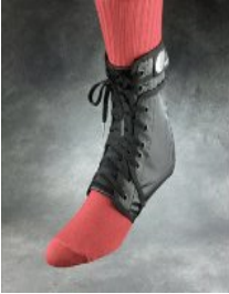
Ankle Gauntlet - used for ankle stabilization after sprains, strains or tendonitis