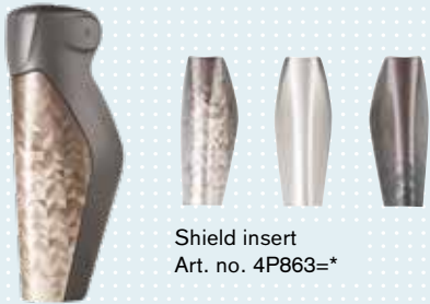
Shield insert Art. no. 4P863=*