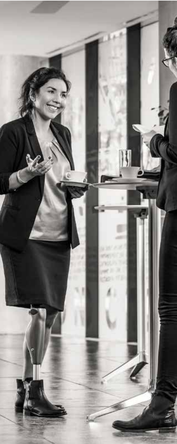
C-Leg Protective Cover | Art. no. 4X860=* Individually adaptable protector with foot cuff for C-Leg and tube adapter.