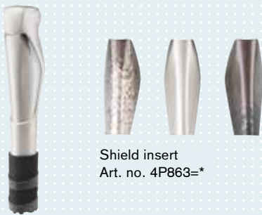
Shield insert Art. no. 4P863=*